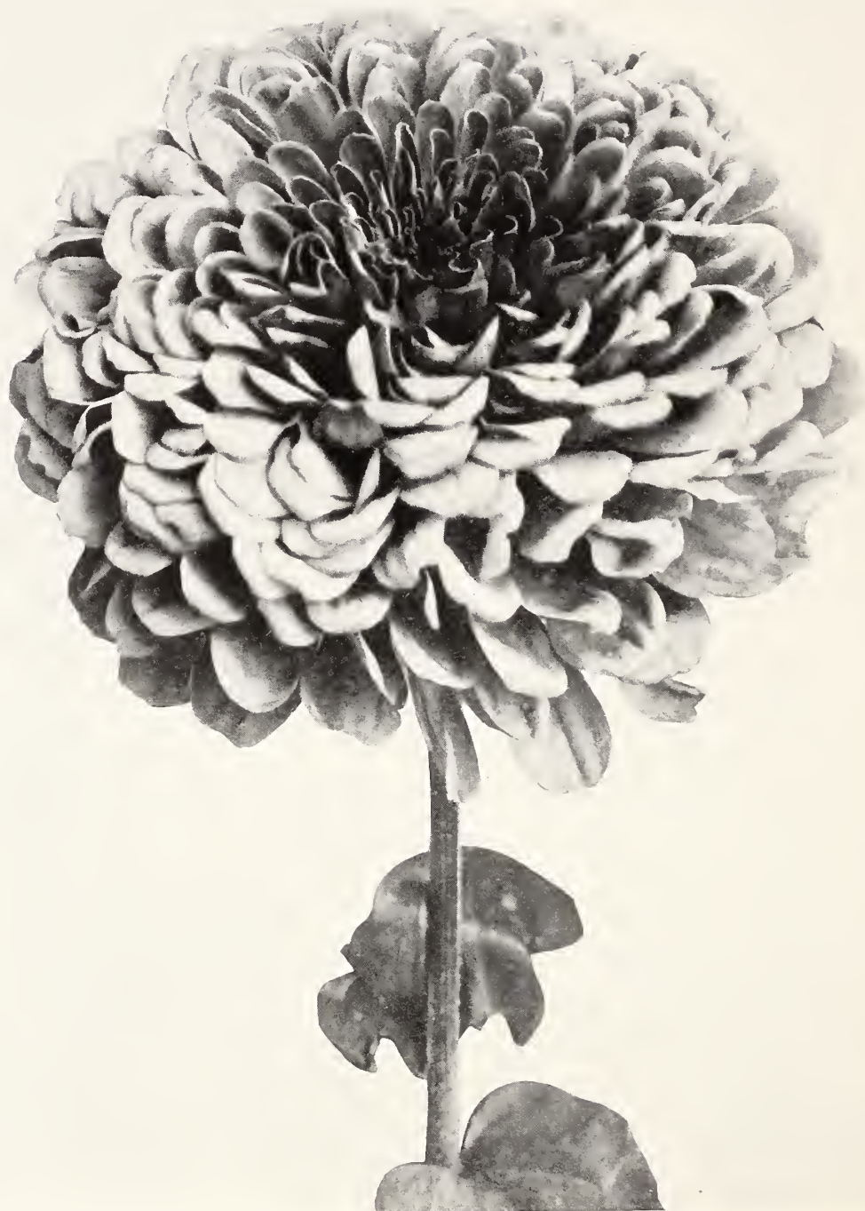
ZINNIA, DAHLIA FLOWERED ORIOLE